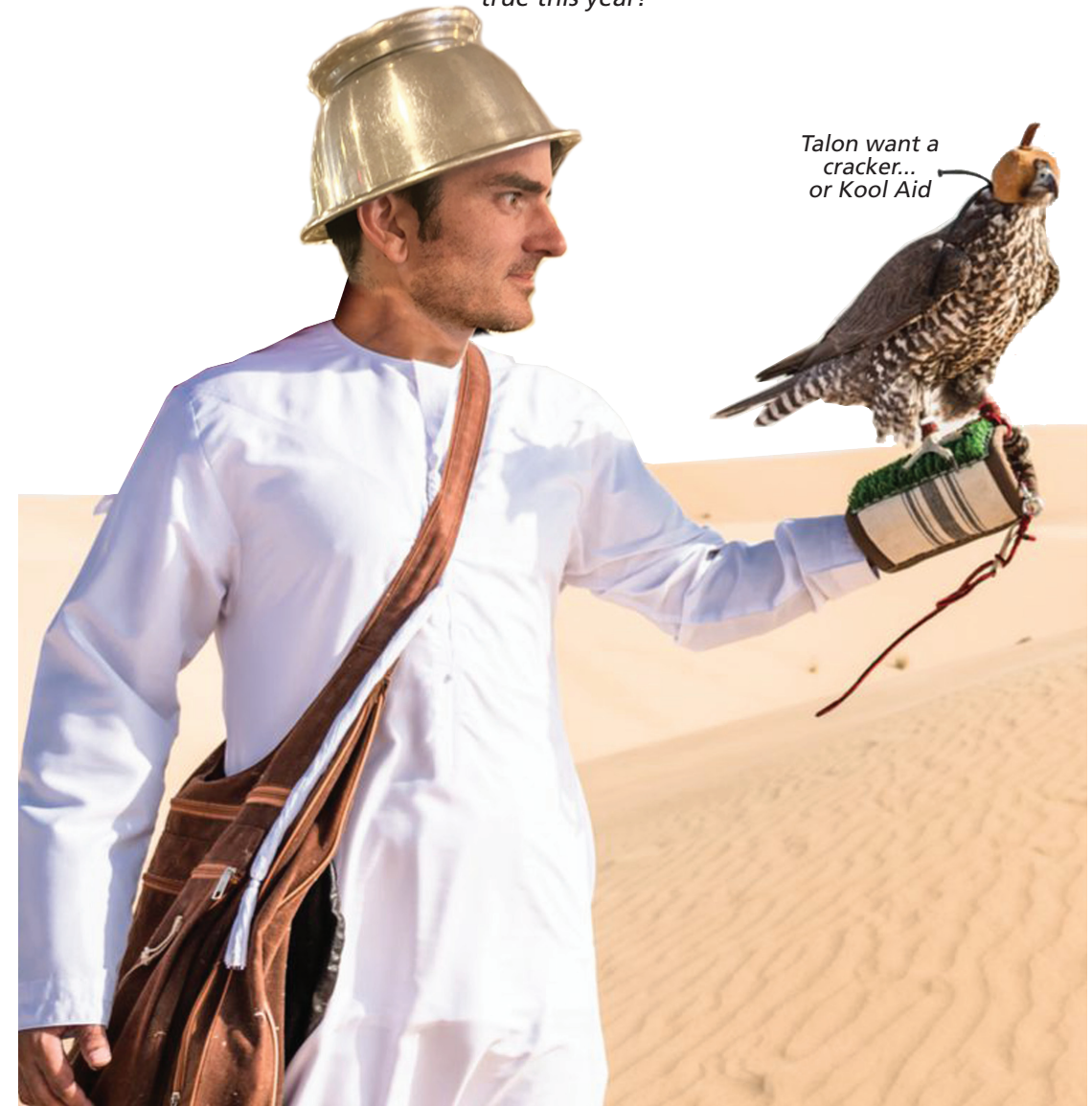
Talon want a cracker... or Kool Aid

Ah, my noble Talon, fly away, fly away dear friend, seek out those community do gooders that could join our club and increase thy numbers. Seek out a person, woman or man, no preference, just someone with desire to help and deep pockets!. Now fly away Talon and make my installation prediction of +12 members come true this year!