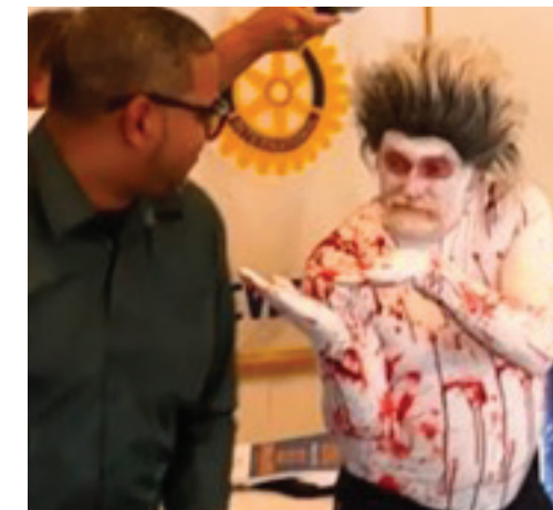
Yes Virginia the club is full of delinquents in costume